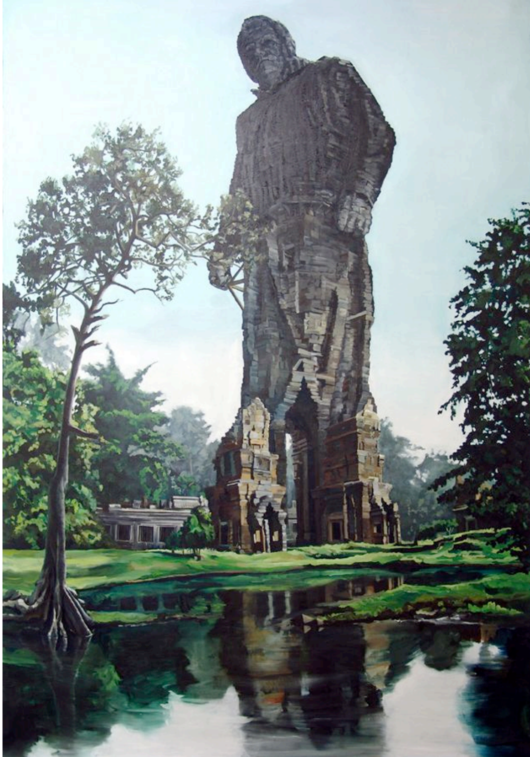
Monument , 2009, Entire diptych installation Painting, 300 x 210 cm, oil on canvas Individual animation [Animation: Edition of 3 +Artist’s proof]