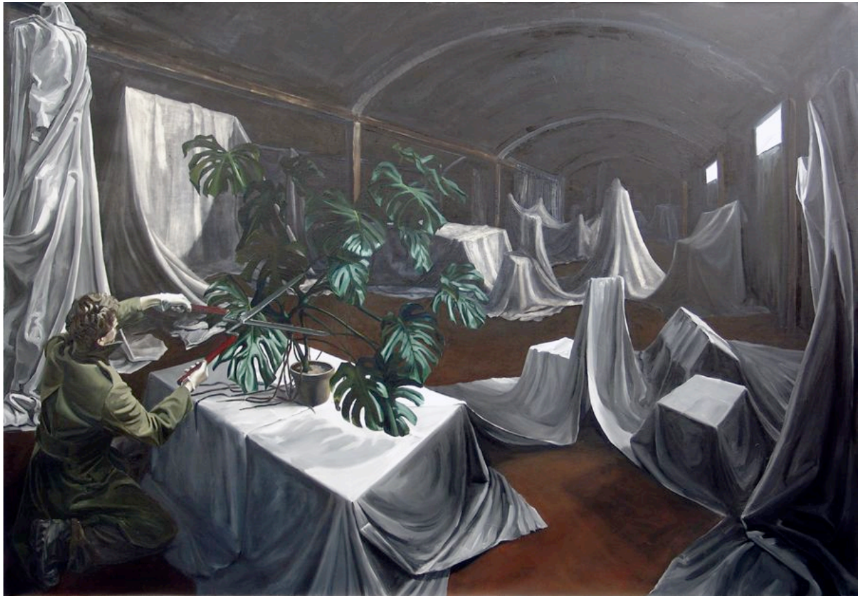
Cut , 2009, 210 x 300 cm, oil on canvas