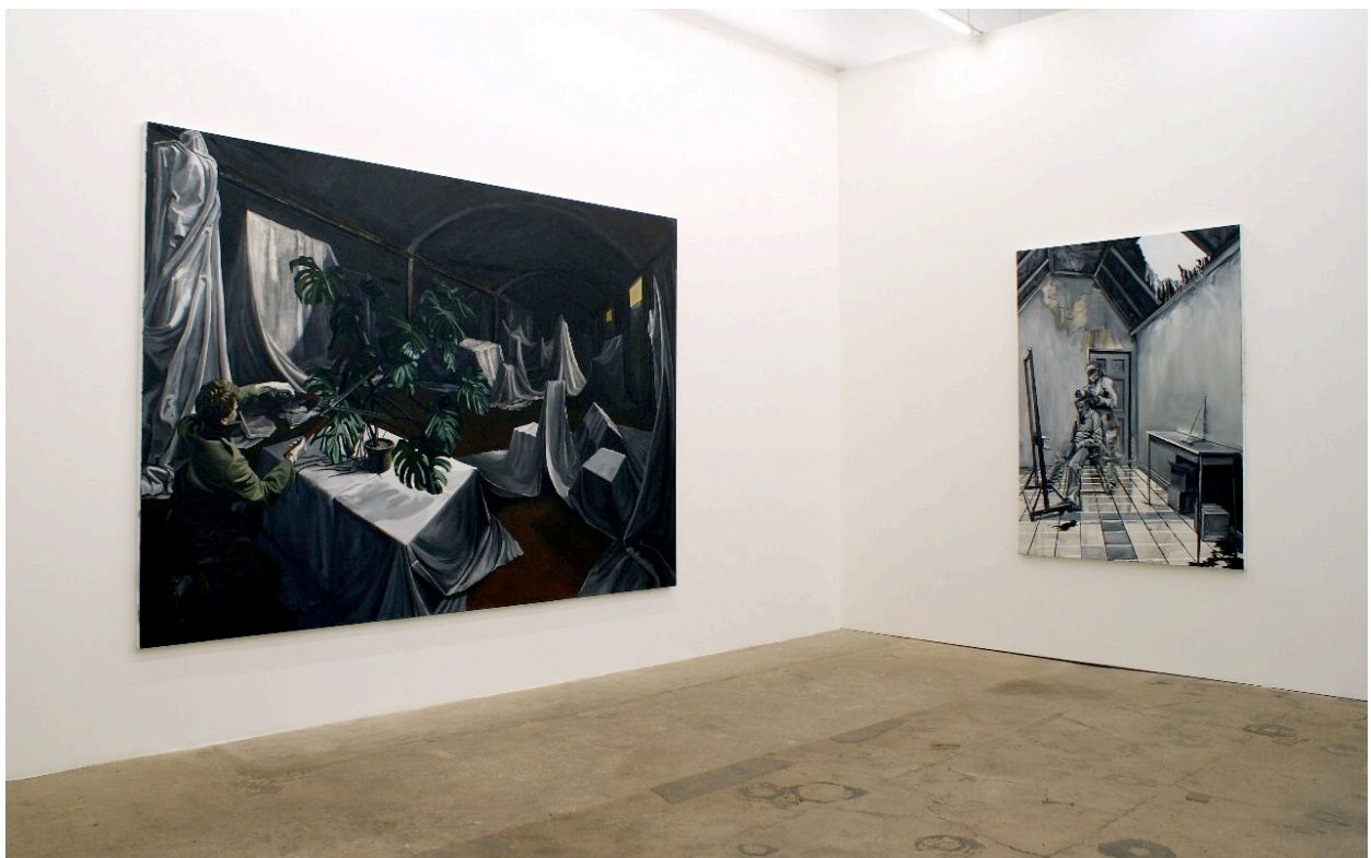
Installation view, 2009, Filipp Rosbach Gallery