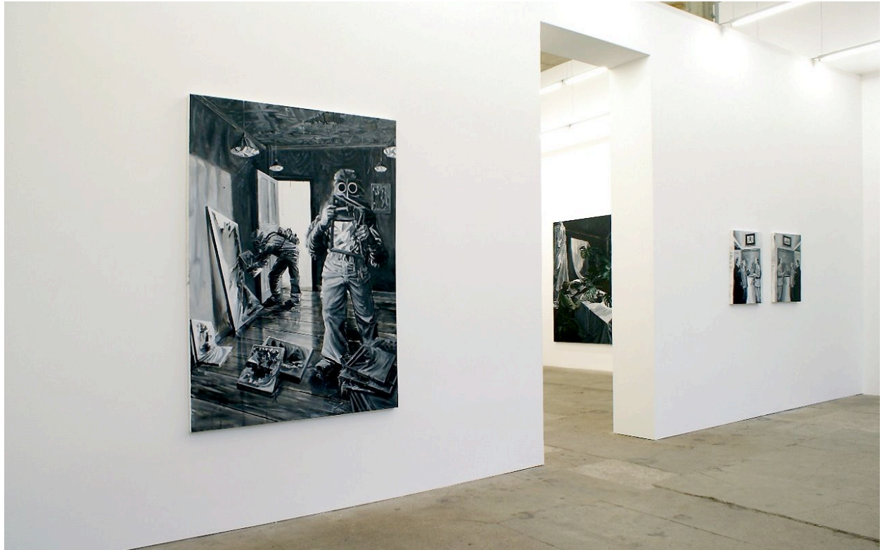
Installation view, 2009, Filipp Rosbach Gallery