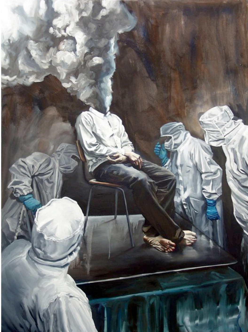
Cloud Chamber , 2009, 200 x 150 cm, oil on canvas