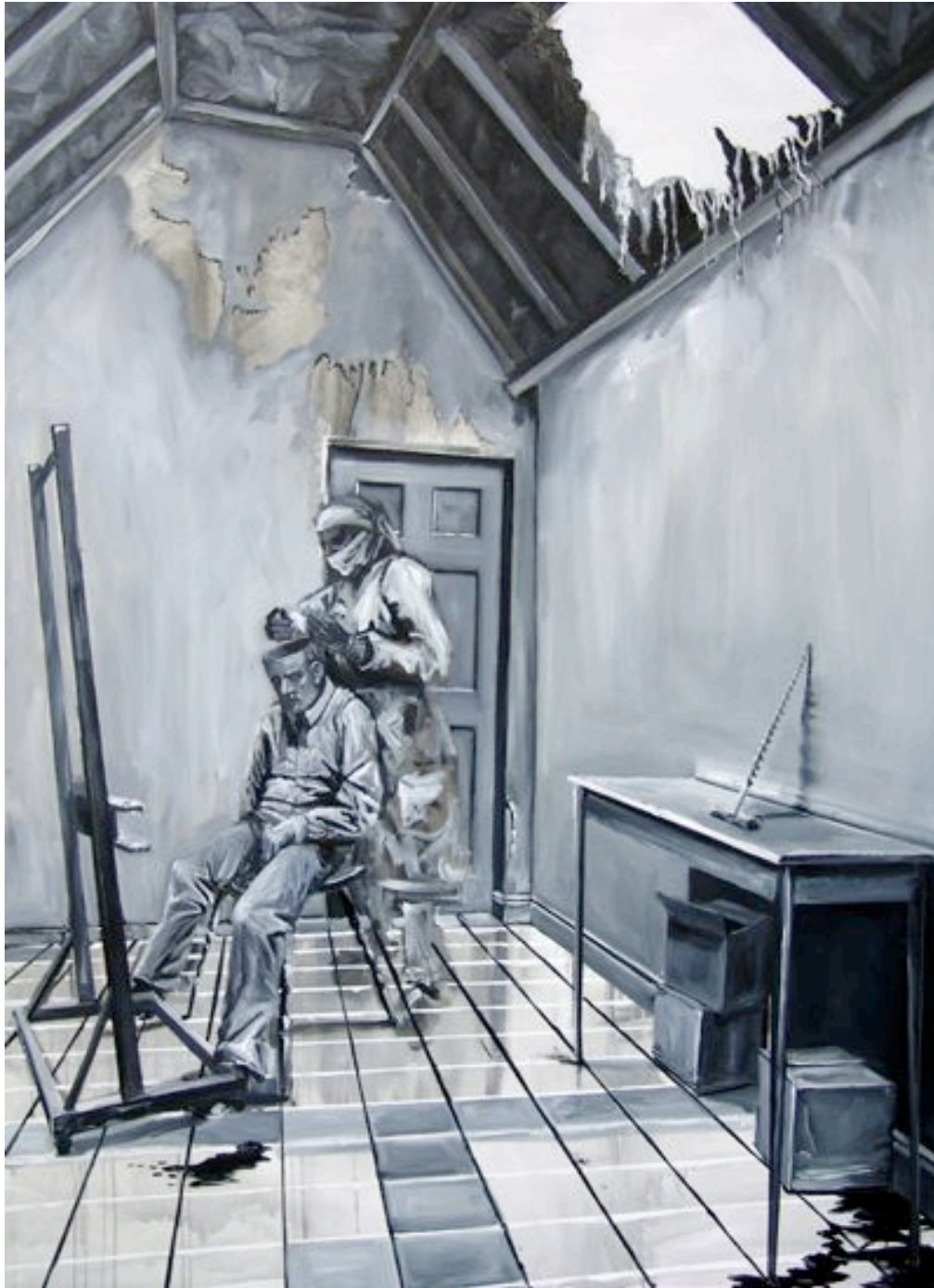
Thought Experiment 7 , 2008, oil on canvas , 180 x 130 cm