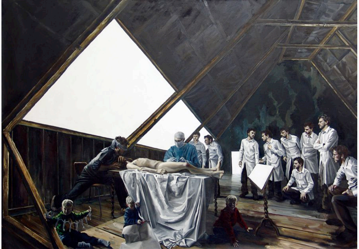
Dissection , 2009, 210 x 300 cm, oil on canvas /Private Collection, Leipzig