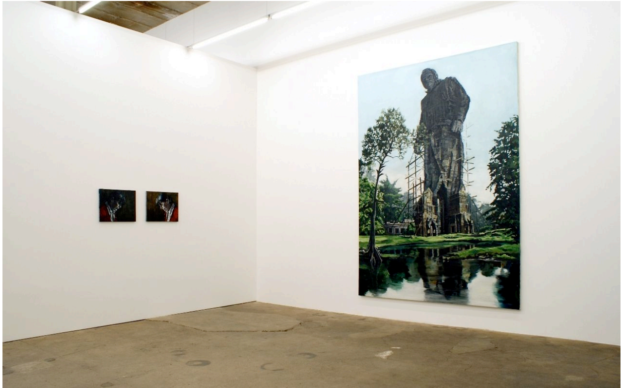
Installation view, 2009, Filipp Rosbach Gallery