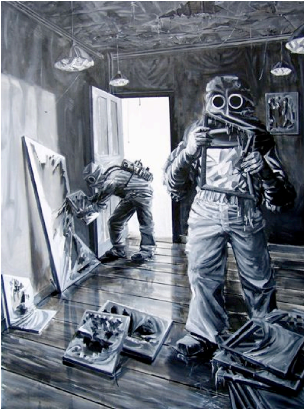
Thought Experiment 8 , 2008, oil on canvas , 180 x 130 cm