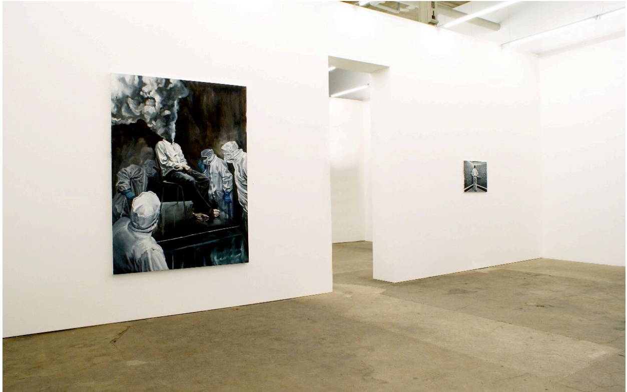
Installation view, 2009, Filipp Rosbach Gallery