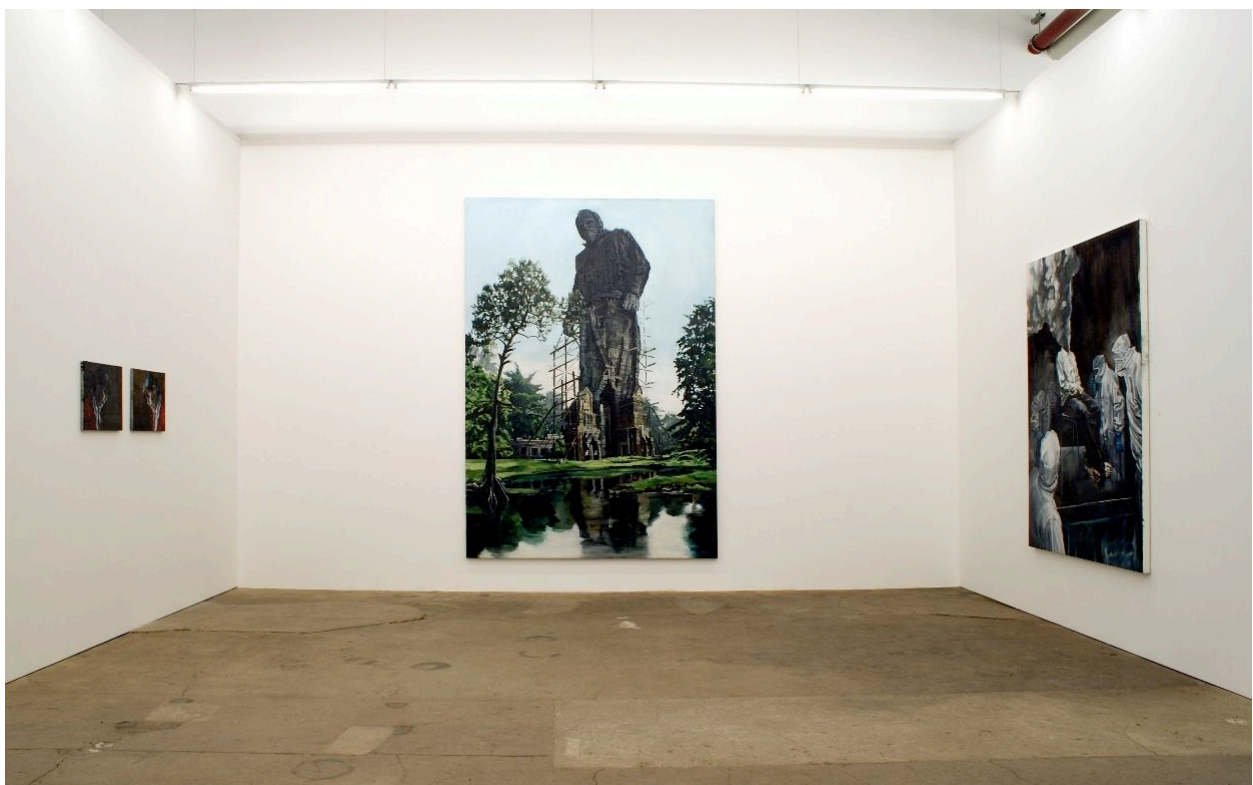
Installation view, 2009, Filipp Rosbach Gallery