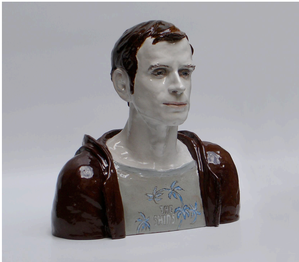
Matthias 2 , 2008, glazed ceramic, painted, 39 x 36 x 25 cm