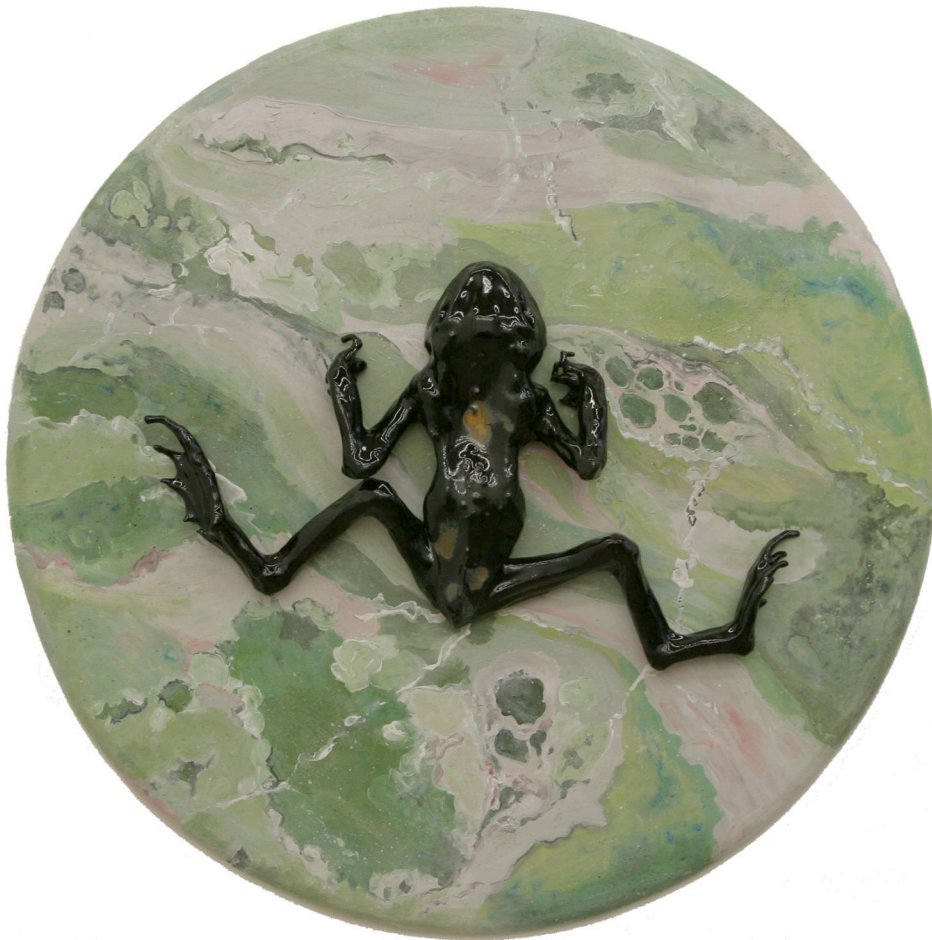
Mumie /Mummy I , 2007, Ø 80 cm, glazed ceramic, acrylic on chipboard