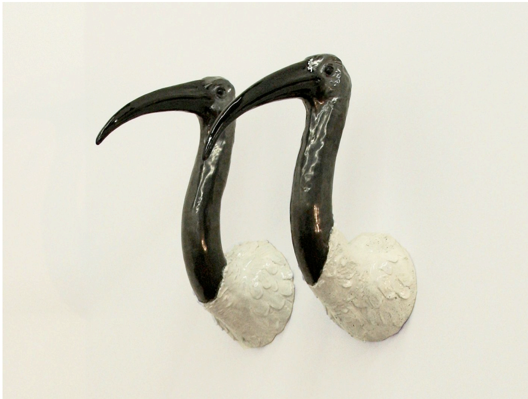
Ibises , 2008, glazed ceramic, each 52 x 21 x 43 cm