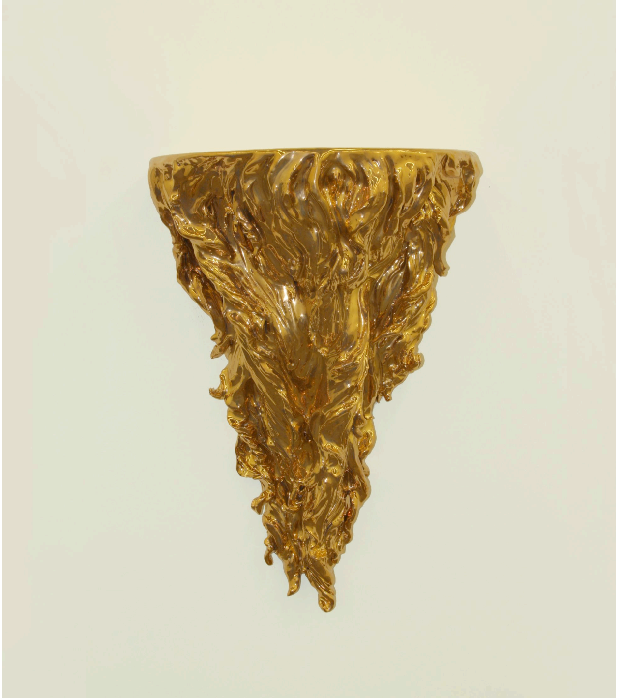
Bart / Beard , 2009, glazed ceramic, gleaming gold, 51 x 37 x 22 cm