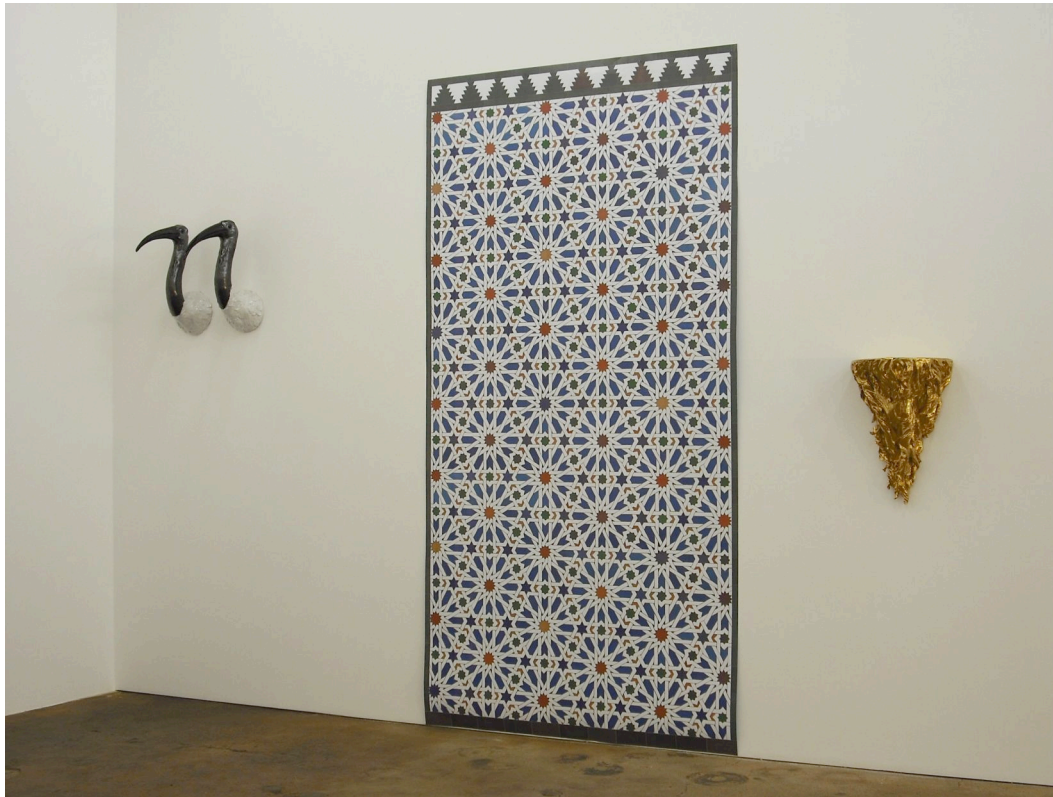
Installation view, Ibises / Tapete / Wallpaper , 2009, Digital Print, 280 x 140 cm / Bart / Beard