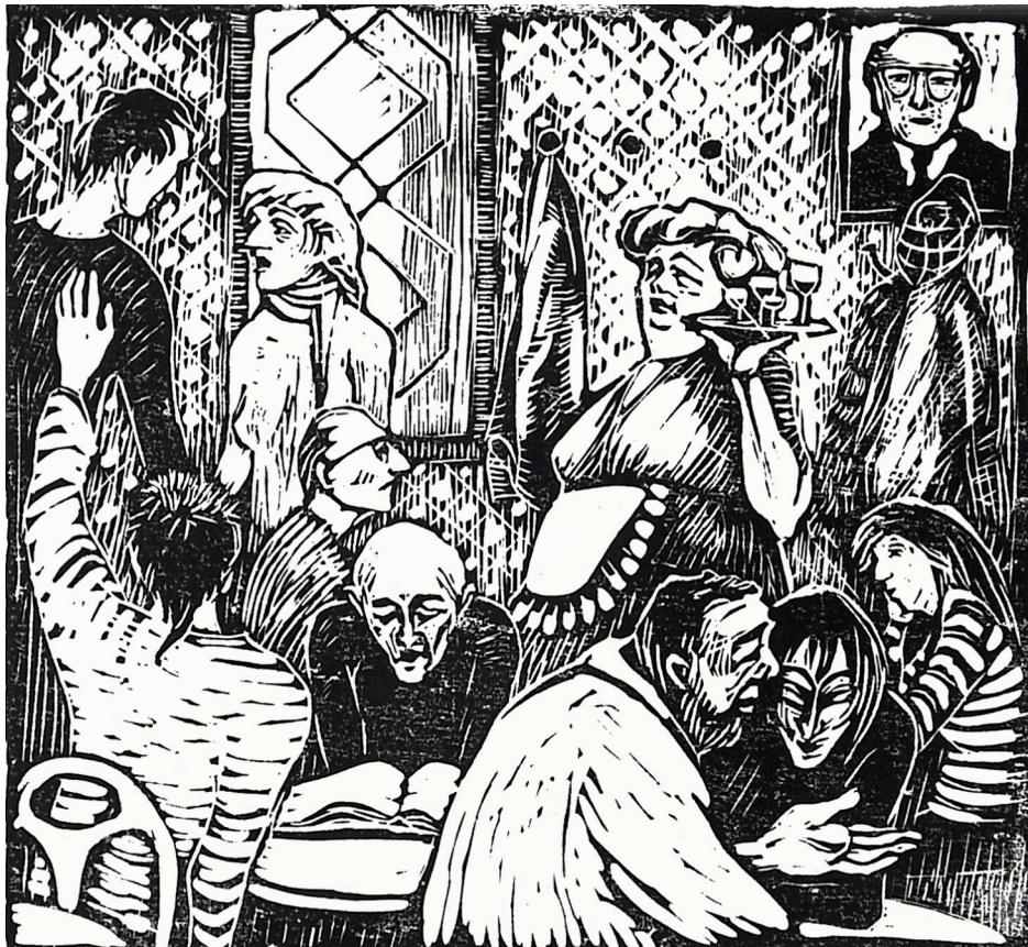
Café Corso, Leipzig, 1984, Linocut, 21 x 23 cm, Sheet 30 x 40 cm, New print 2009, Edition 200