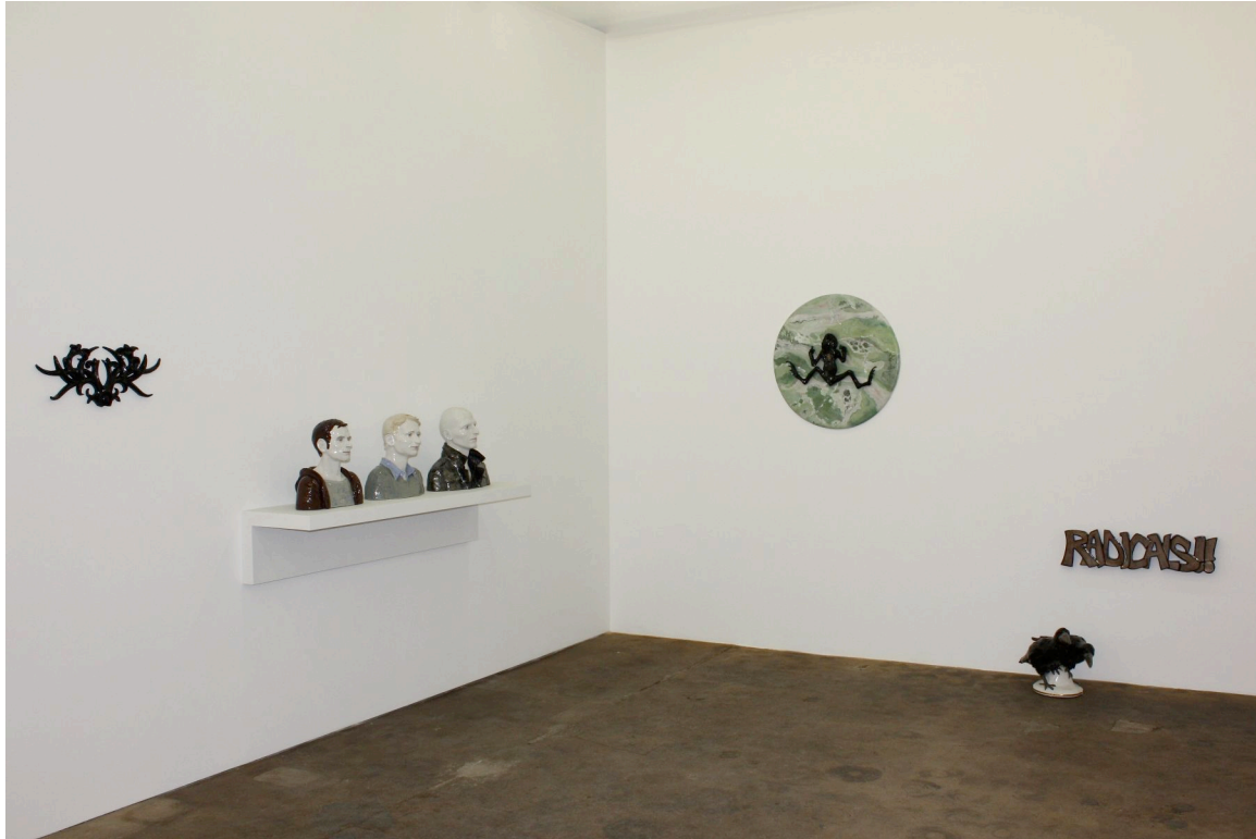
Installation view, 2009, Filipp Rosbach Galerie