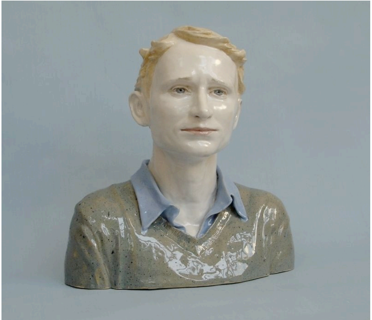
David , 2007, glazed ceramic, painted, 38 x 38 x 25 cm