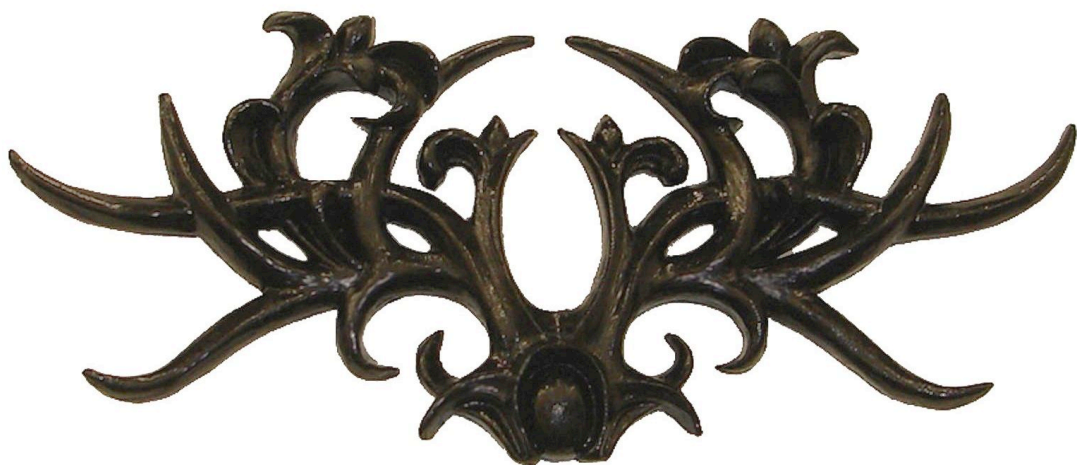
Tattoo Melanie , 2006/9, Polymer plaster, 24 x 56 cm, Edition 7