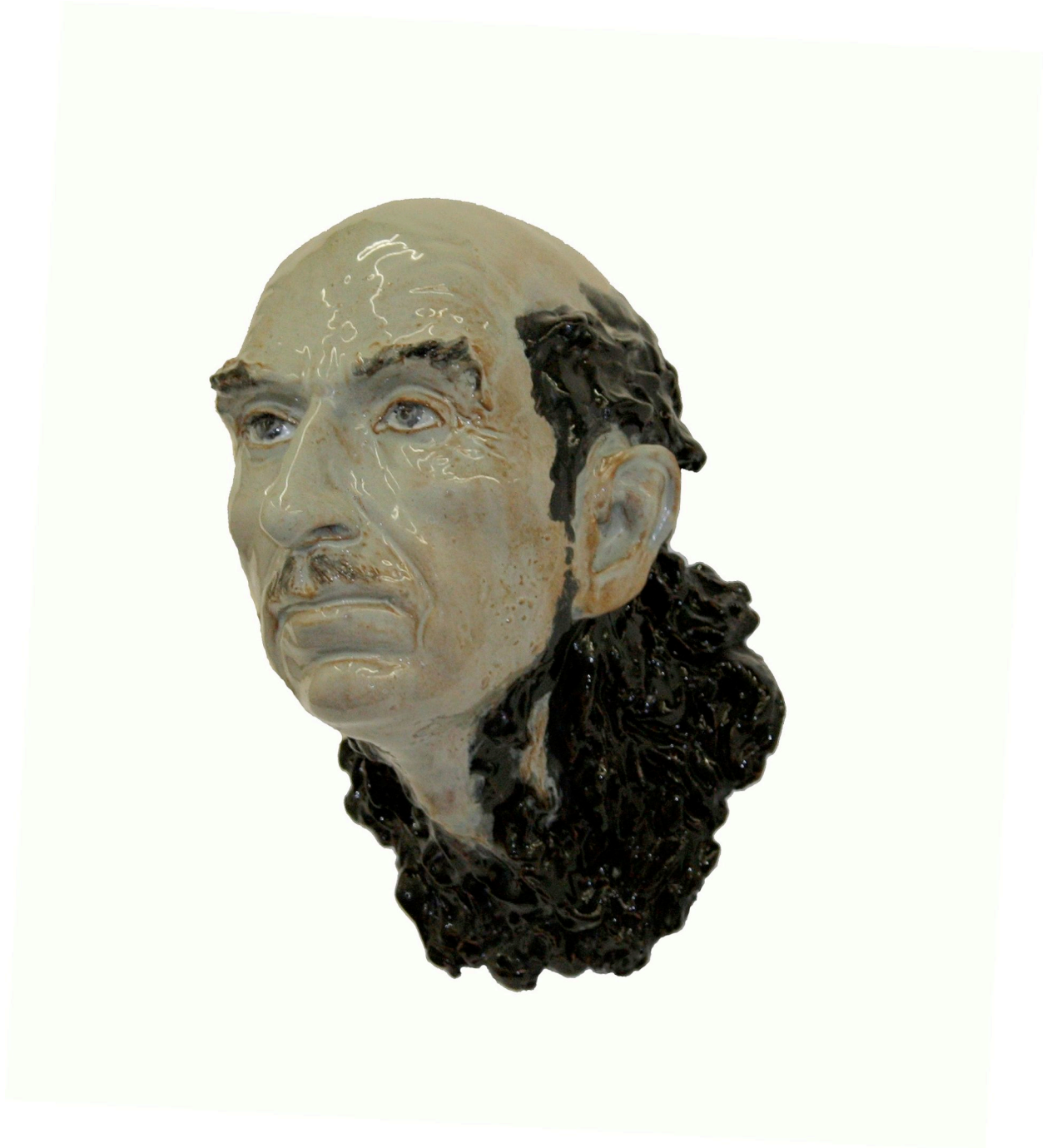
Steinert , 2009, glazed ceramic, 31 x 21 x 24 cm