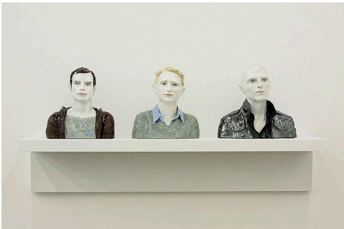
Matthias 2 , 2008, 39 x 36 x 25 cm / David , 2007, 38 x 38 x 25 cm / Uwe , 2007, 40 x 43 x 25 cm, glazed ceramic, painted