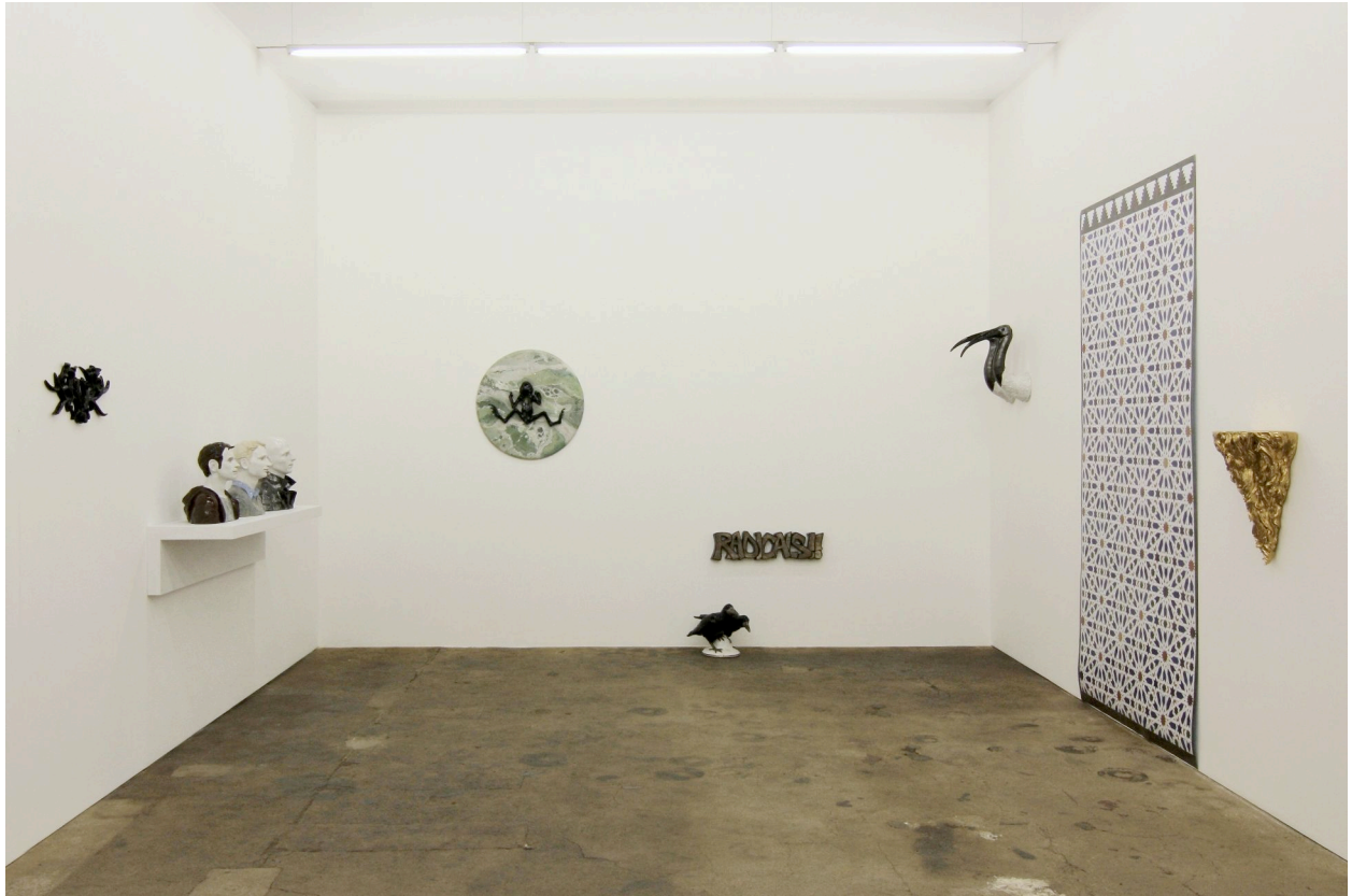
Installation view, 2009, Filipp Rosbach Galerie