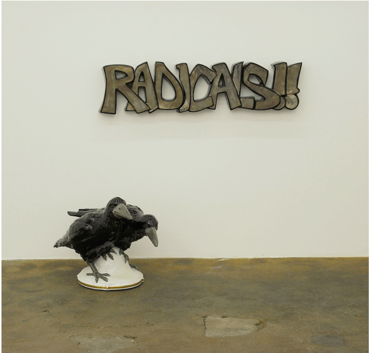
Radicals , 2006, glazed ceramic, 19 x 80 x 5,5 cm, / Crows , 2006, galzed ceramic, 37 x 50 x 33 cm